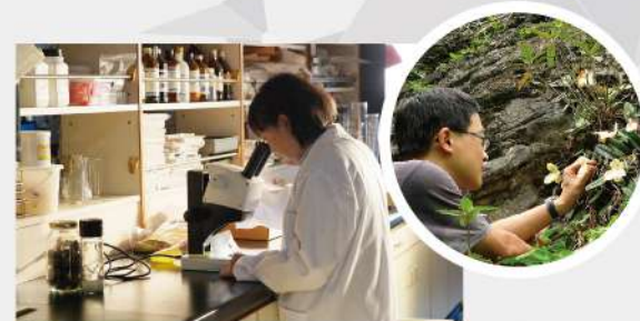
左：詹美鈴博士在實驗室研究居家昆蟲 右：李勇毅博士到野外調查蘭花

在這個舒適的空間中，我們可以藉由沉浸在螢火蟲之夜，或科學家探索自然、發現科學的精彩故事，思索我們與自然的關係。在特定的時段，科學家們會親自來到這裡與大家見面，或是科學教育人員帶著我們進行有趣的科學教育活動。