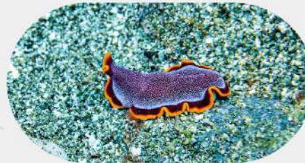
Pseudoceros ferrugineus Hyman, 1959