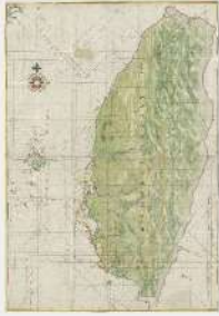
Map of Formosa (Taiwan) by Dutch

Our encounter with science begins with our admiration for nature. Let's start with nature and learn about Taiwan from a global perspective through story after story about the NMNS collections and say hello to science.