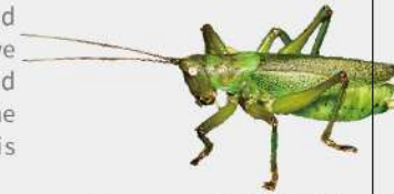
Salomona ogatai Shiraki, 1930

How do organisms such as fungi, plants, and animals adapt to land and water and develop different creative ways of moving to transfer spores and seeds, jump, and swim? Let's feel the movement and experience this dynamic world with the scientists.