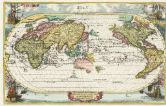
The Principal Voyages of Europeans to Foreign Lands, 1703

Our encounter with science begins with our admiration for nature. Let's start with nature and learn about Taiwan from a global perspective through story after story about the NMNS collections and say hello to science.